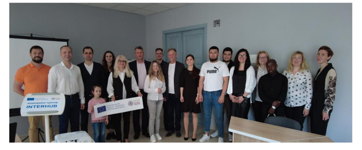
International Students Adaptation and Integration/ INTERADIS 619451-EPP-1-2020-1-NL-EPPKA2-CBHE-JP